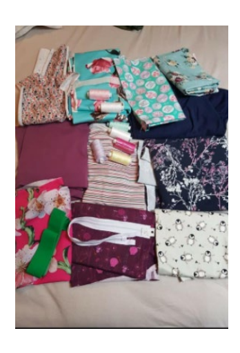
Volunteers from the Kildare subgroup of Masks4AllIreland, and masks ready for distribution

By the end of the June 2020 the issue of mental health had grown with many individuals anxious about the impact of the pandemic, and in dealing with the restrictions on social interaction. In response, and as a companywide initiative, CKLP developed a series of mindfulness support messages which were made available through the social media platforms. In addition, mindfulness sessions were run by the Company for its clients and other stakeholders, using expertise within the Company. Mindfulness sessions were also established for staff across all programmes and this support remains in place as the pandemic continues.