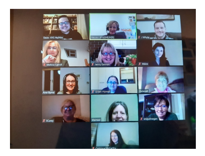
Educating our educators, the new way - over ZOOM - LGBTQ Awareness Training, SICAP 2020

It is suggested that technical support should be provided on a national basis to support the capacity of Local Development Companies to provide blended learning approaches and improved online offerings to strengthen the capacity of SICAP to overcome emergency situations like the current COVID19 pandemic.