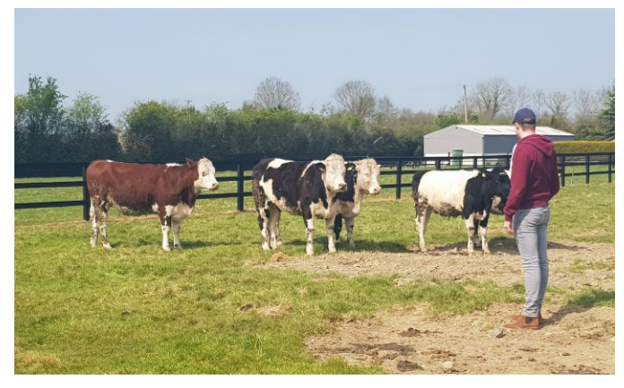
SICAP encouraged young farmers to help neighbours in North West Kildare during lockdown

While outreach community development work was impacted by a lack of face-to-face contact with community groups, food and medicine deliveries have continued throughout COVID 19 in some areas as well as supporting older farmers in isolated rural areas.