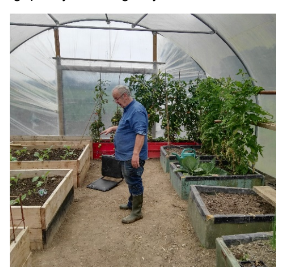
Cooleragh Men's Shed Staplestown at work in their polytunnel during COVID 19

SICAP engaged in a number of collaborations with local partners in response to identified needs during the pandemic in 2020. These collaborations involved engagement with a number of other organisations that SICAP works with on an ongoing basis and the relationships already in place assisted greatly in responding quickly to emergency needs that were identified.