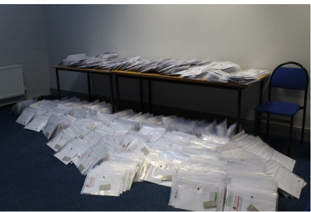
Christmas Food Hampers and Art Creativity packs for Older People cocooning over Christmas due to Covid 19 Restrictions