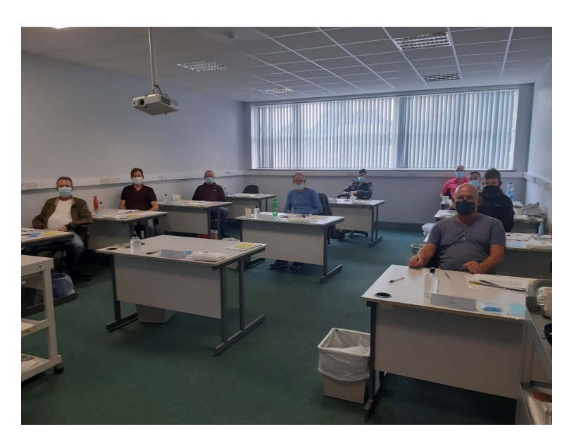
One of the Safe Pass Courses that went ahead during restrictions - CKLP Training Rooms, Naas

As the focus was on income supports and emergency assistance there was a significant reduction in the number of referrals for education, training and employment supports. This challenge was overcome to a large degree by further collaboration between programmes managed by County Kildare LEADER Partnership and a prioritisation of supports to beneficiary groups most affected by the COVID 19 pandemic.