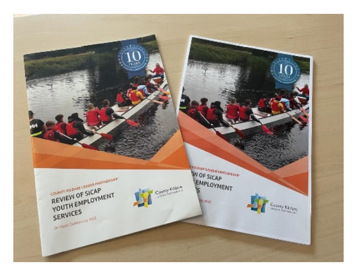
Review of SICAP Youth Employment Service launched online in July 2020.