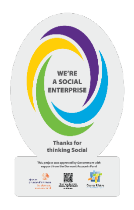
Figure, 10 & 11: Social Enterprise site visit to Lullymore Heritage and Discovery Centre, Figure 11: New Social Enterprise Plaque