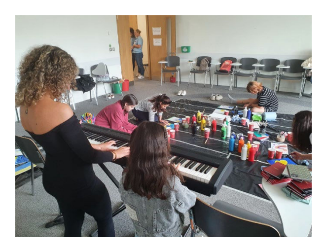
Figure 2,3,4: Photos From Ukrainian Independence Day held in Maynooth College Campus:

Ukrainian Independence Day fell on 24<sup>th</sup> August 2022. SICAP helped the Ukrainian communities throughout Kildare mark this day. It was an emotional day for most people. The biggest celebration was held in Maynooth University before the group's departure. SICAP provided food to cook traditional dishes, entertainment and a sizeable number of staff helped out during the day and evening to ensure this very important day could go ahead.