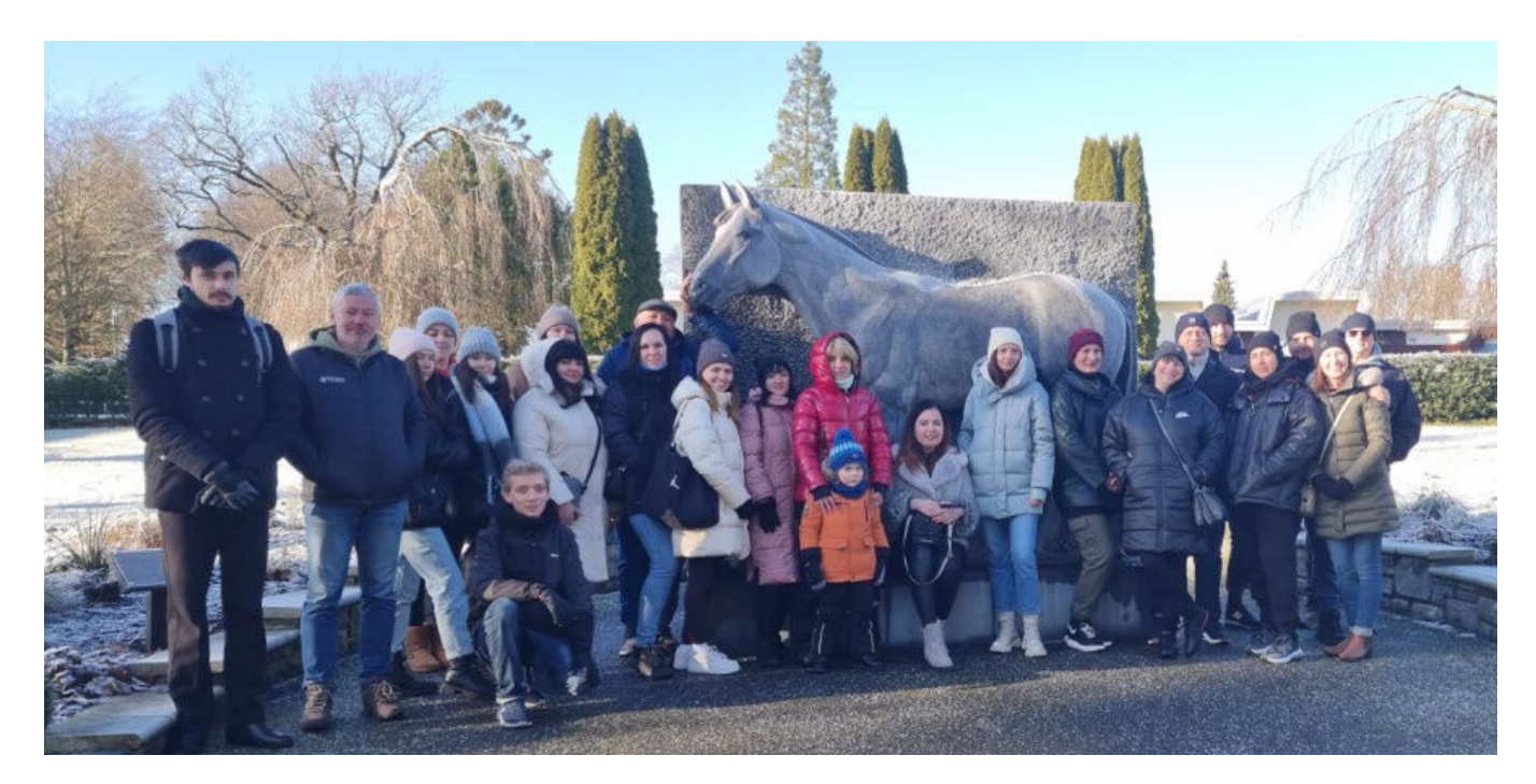
Figure 5: (One of the day trips organised) Residents of Bert House at the Invincible Spirit sculpture at The Irish National Stud and Japanese Gardens