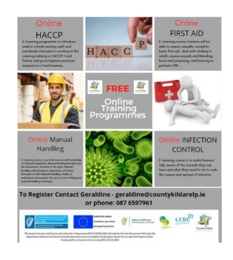
Figure 13, 14, 15 – Selection of Online Courses provided through SICAP 2022