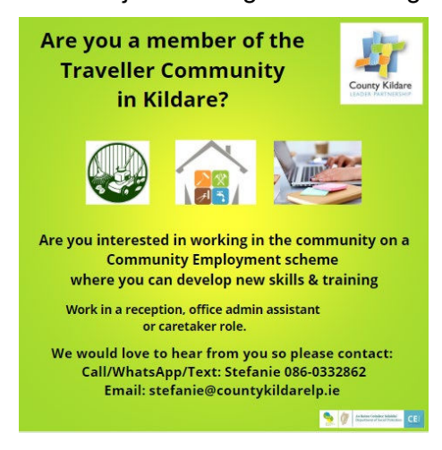
Figure 12: Kildare Traveller CE Scheme Poster advertising opportunities for Traveller Community on CE Scheme

In 2022 SICAP engaged with more Travellers than ever before, case loading nineteen. Four progressed to employment, Many are under 25 years of age and engaging with the youth programmes. There are many barriers to Traveller engagement in a CE scheme or education support roles and these take time to work through. Ongoing mentoring and capacity building is essential and time consuming. It is often a case of one step forward and two steps back when dealing with these issues. Overcoming discrimination and bias in relation to securing CE placements is a major challenge that is being dealt with on an ongoing basis.