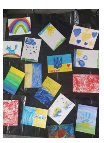
Figure 2 Figure 3 Figure 4