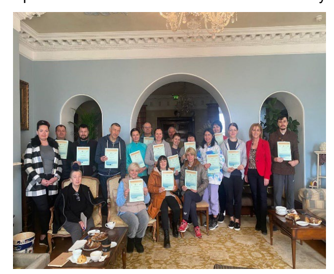
Figure 1 Some of the Ukrainian students receiving their Manual Handling certificate

While most people of working age are eager to get work, the rule that if you leave work 'voluntarily' a person will not be able to claim jobseekers for 9 weeks is a major barrier. This is a huge concern especially for people living in emergency settings and waiting to be housed in pledged accommodation throughout the country. They cannot be without an income for 9 weeks. 2 x Manual handling courses were delivered for 29 people in Athy. 9 men were also supported to obtain Safepass training. The Department of Social Welfare – Employer Relations officer also attended and provided information to residents of one facility.