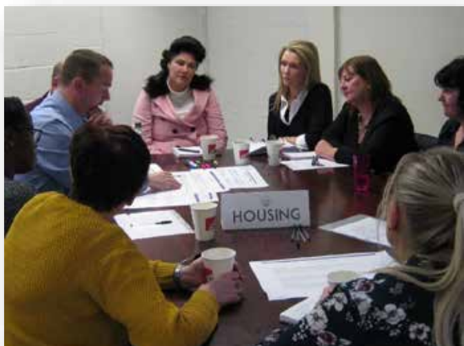
Inter-Agency workshop Oct 2018

The final Strategy offers an ambitious series of actions across agreed strategic priorities that, collectively, will lead to delivery of positive outcomes for the Traveller and Roma community. Whilst the implementation strategy will be driven by the Interagency Steering group, it is wholly dependent on the cooperation and collaboration of all agencies that interact with, engage with and provide services for Traveller and Roma people and access to additional resources. In order to ensure that the Strategy delivers practical and real change for the people whom it represents.