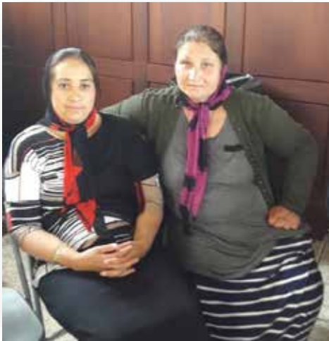
Roma Focus Group Newbridge

Overall, the majority of the steering group reported that the process was positive, and everyone came to the table willing to work together collaboratively which often does not occur. Agencies such as the Citizens Information Service reported that they have been working with both of these communities for a long period and were becoming frustrated with the continuous barriers that people were facing. This was especially the case with the Roma Community, who face some of the biggest institutional barriers when they do not have a home and cannot access the social welfare system. At least now all of the agencies are aware of these barriers and processes can be put in place to try and support these people going forward.