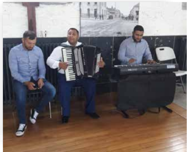
Roma focus group Newbridge Town Hall

When speaking with all of the groups about what will happen now the key word response has been “Hope”. All of the groups and agencies involved are very hopeful that what has been put in the action plan will happen and that work will commence immediately. Members of the Traveller Communities have been involved in a lot of consultation process over the years and KTA reports that their members are confident that this time it will be different and the meaningful engagement that they have witnessed so far will continue into the future.