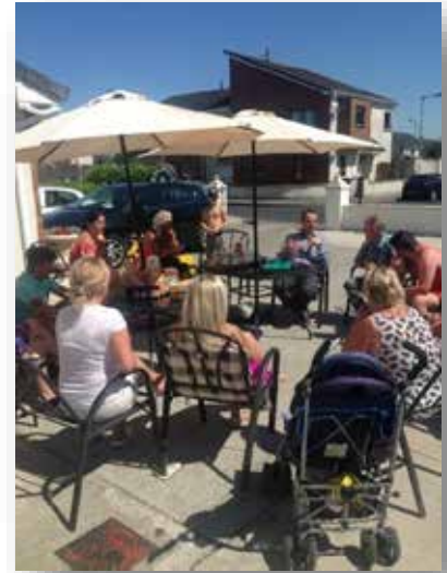
Traveller Focus Group Athy

SICAP and the LCDC have been working in consultation with the members of the Traveller community for a long period of time and their positive working relationship with Kildare Traveller Action (KTA) was of real benefit to the success of the consultation process with people from the Traveller community. Throughout the whole of the project KTA were consulted with and included. This included being involved in the recruitment of the Outreach Worker, being part of the inter-agency steering group and being involved in the consultation process. KTA believe that by SICAP leading the project in partnership with Kildare County Council there was a lot of positivity towards the project as it demonstrated that everyone involved was serious about including members of the Traveller and Roma community in the future of the county.