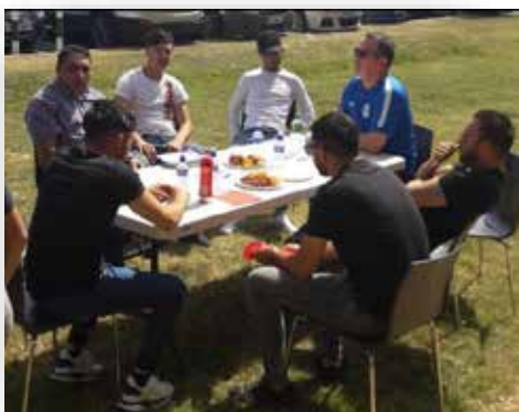
Roma Young Men’s Consultation Newbridge

Roma people have a long history of living in Europe with a presence recorded from the 13th Century. The term 'Roma' is believed to be first chosen at the inaugural World Romani Congress held in London in 1971. This term is now widely accepted across the European Union (EU) to describe a diverse range of communities, tribes and clans. The Roma community in Ireland face a range of challenges, particularly in relation to racism and discrimination. They experience exceptionally challenging issues when seeking to access Social Welfare supports due to the Habitual Residency Condition (HRC) and difficulties accessing Social Housing Support due to residency requirements and changes in local housing policies. In developing this inclusion strategy in County Kildare, considerable engagement with Roma communities has enabled us to estimate, anecdotally, a population of Roma living in Kildare to be in the region of 500 – 600.